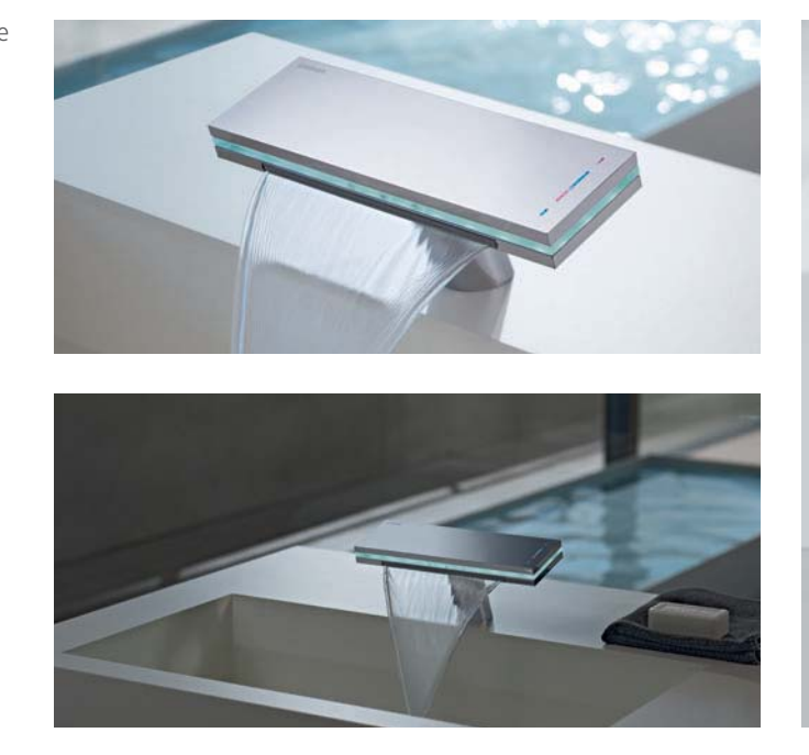
The experience of light, colour and water: Controlled by sensors built-in to the glass panel, HANSAMURANO X reacts in two stages when you move towards it. First a soft light comes on by way of welcome. When your hands get close to the fitting, it starts its flow, the light impressively illuminating the clear curtain of water.

All you have to do to regulate the water temperature is gently tap the temperature markers with your finger. Blue and red lights act as unambiguous visual indicators.