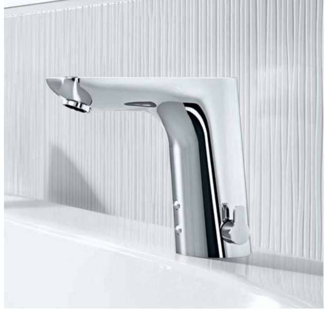
When your hands approach the sensor-controlled fittings here HANSALIGNA – water flows automatically: always exactly at the pre-selected temperature; always exactly at the rate required.