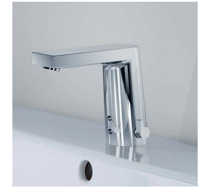
As each of the new electronic fittings – here HANSASTELA – embodies the characteristic design of its range, the unmistakeable design context is retained throughout the bathroom.