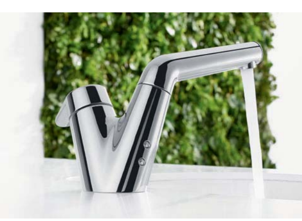
Always different, never the same: HANSA SIGNATUR opens up a different perspective from every angle. And with every turn of the spout, every setting of the lever, the expressive fitting reveals a new form.