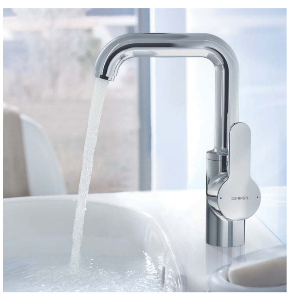
Side operated fittings are very popular. Because what looks attractive also proves its worth in daily use: Surfaces stay clean and bright longer because the water dripping from your hands is kept away from them. That is hygienic, makes cleaning easier, and is a pleasure to see – every day, and well into the future.