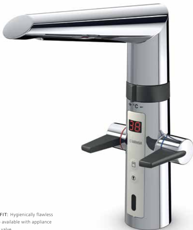
HANSAFIT: Hygienically flawless and also available with appliance shut-off valve.