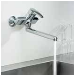
All around flexibility: HANSAMIX as a wall-mounted fitting with a 120° swivel range.

HANSAMIX is one of the best known and most successful HANSA kitchen fittings. With its timeless elegance and proven components that are constantly refined with state-of-the-art technology, it is still considered to be the standard for functional kitchen fittings. HANSAMIX has stood the test of time and is still as popular as ever: As a fitting with HANSAPROTEC system mounted on the sink you can enjoy your drinking water with the peace of mind that comes with knowing it is in safe hands. The high-grade chrome, ease of use and the clever functional details ensure that HANSAMIX will become a classic in your kitchen, too.