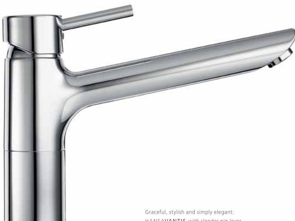
Graceful, stylish and simply elegant: HANSAVANTIS with slender pin lever