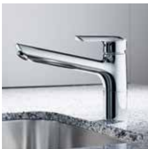
The solid lever version of HANSAVANTIS is a timeless classic.

Equipped with the HANSAPROTEC system, HANSAVANTIS guarantees the high quality of your drinking water and helps to put your mind at ease.