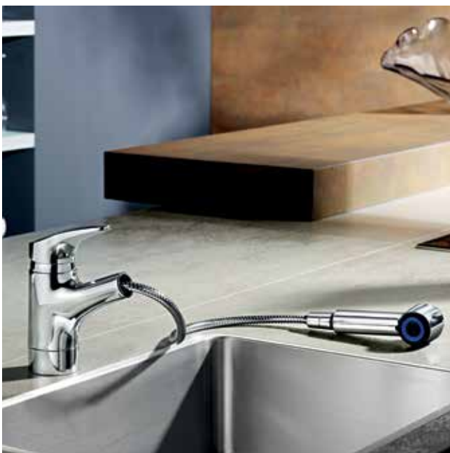
The pull-out hand shower boasts a flexible and robust metal hose, which allows you to pull the shower head to wherever you need water. The two HANSAMIX standing fittings are also available with an appliance shut-off valve.