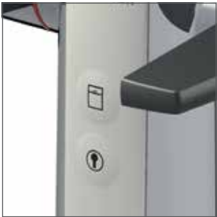
Reassuringly safe: The electronic appliance shut-off valve (optional) only supplies water during the selected time period and closes automatically.