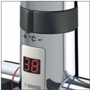
Extra comfort: The water temperature can be preset via adjusting ring for the contactless operation. The display always indicates the current temperature and warns of temperatures above 42°C.