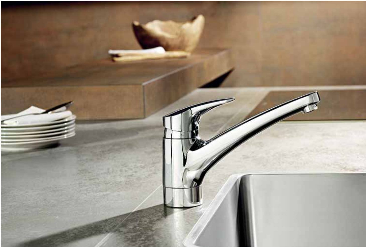
Classic design and reliable functionality: HANSAMIX with a swivel spout.