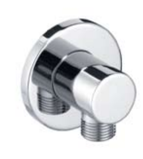
53947 Wall outlet for shower hose DN 15 suitable for all concealed fittings