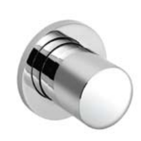
54941 Exposed part for angle valve DN15/DN20 complete with: handle, sleeve, rosette and adjustable extension (Angle valve DN 15/DN 20 to be ordered separately)