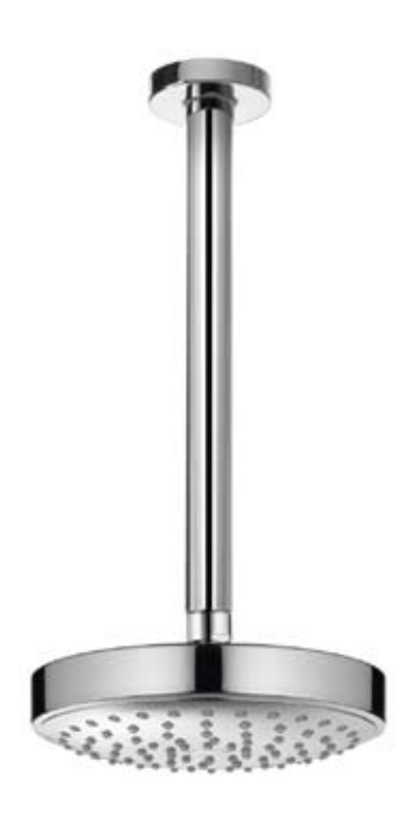
Shower head with ceiling-outlet DN 15 Ø 180 mm, with shower head rail, restricted flowrate 10 l/min., Height: 100, 300 mm