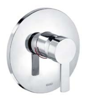
53971 Single lever shower mixer concealed set suitable for Flexx Boxx EHM DN 20, complete with: handle, sleeve and rosette (Flexx Boxx EHM DN 20 to be ordered separately)