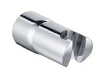
59991 Wall bracket for hand shower for shower hoses with fitted conical end brackets with adjustable tilt angle 20-65° Projection: 97 mm