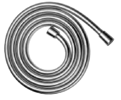
1250, 1600, 2000 mm