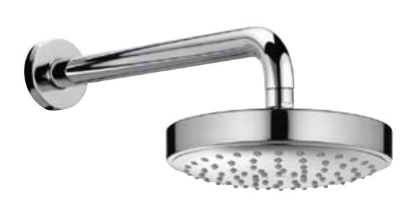
Shower head with wall-outlet DN 15 Ø 180 mm, with shower head rail, restricted flowrate 10 l/min., Projection: 300, 450 mm